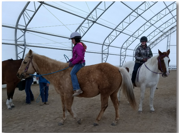
Riding bareback helps balance and seat position. When it is cold, bareback also keeps legs warm!

Thank you to Peery Electric who donated and installed new powerful LED lights in the corrals and incoming horse areas on the main ranch. Peery Electric is located in Lamar, CO.