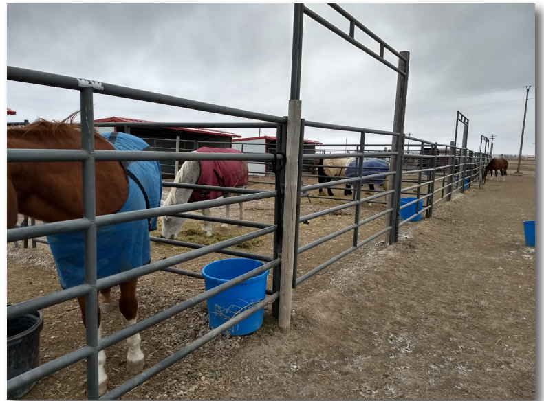
Older horses blanketed for a cold night

The growing number of older horses at Blue Rose Ranch require supplemental feeds. We have three special feeding protocols: Level One is for basic weight maintenance. This is for older horses that are starting to have trouble maintaining muscle mass and they need help to maintain weight. Level Two is for horses that are usually quite old and need serious help to maintain weight. Senior Level is for horses that can only eat specially prepared diets because they can no longer graze and they usually have no teeth left. These horses are healthy in other respects and all systems function well, they just can't get needed nutrition from grazing. One type feed we include in these supplements is a product called "Black Gold". This feed is made 100% from sunflower seeds, has very high protein and is produced in Lamar, CO at Colorado Mills. Rick Robbins, CEO/General Manager of Colorado Mills, has been a wonderful friend to Blue Rose Ranch with donations of "Black Gold".