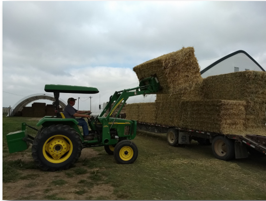
Unloading 4x4x8' bales of oat hay. Each bale weighs just under a ton

The horses thrive on the pasture grasses on both ranch properties. We supplement grazing with large bales of hay on both properties. The large bales weigh about a ton and are moved by tractor.