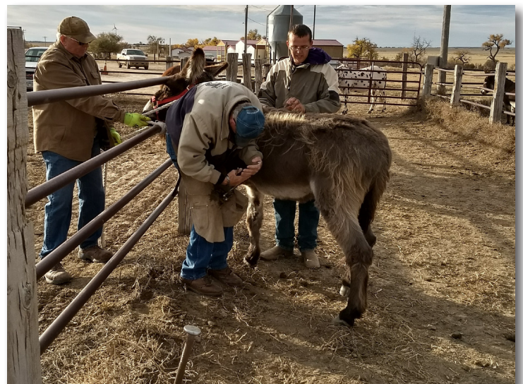
It takes a team sometimes! DonkeyXote was not cooperative having his feet trimmed. Once finished, he discovered the trim helped him walk more comfortably.

We installed a commercial solar powered LED street light on the Canyon Ranch. This increases visibility and safety for the horses.