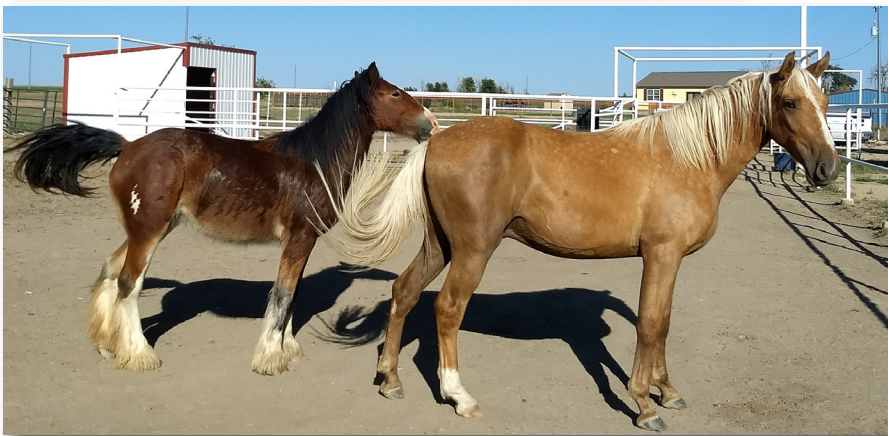
Our handsome Palomino colt is adopted! Thor has a great new home, wonderful horse facilities, and a devoted stablemate.