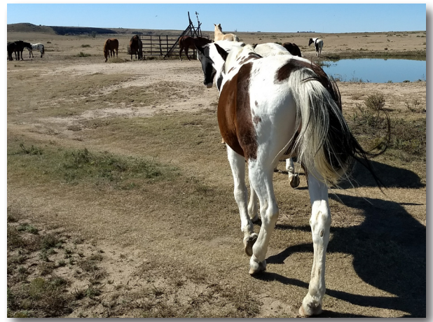
Late fall on the prairie and an overflow pond on the Canyon Ranch

Those of you who have visited know that we operate on two ranches. Both have hundreds of acres for horses to roam in herds and enjoy “just being a horse”. The main ranch is the location of our incoming horse area, the hospital area and the special needs horse facilities, training facilities, the indoor riding arena, hay barns, ranch maintenance workshops, volunteer clubhouse, tack rooms, and the ranch office. The outlying ranch we refer to as the Canyon Ranch because it has four canyons that meander through sections of the property. The Canyon Ranch is twice the size of the main ranch, and has lighted shelters, corrals, and pristine water. Horses that do not need constant medical or dietary supervision are rotated between the two ranches. Many horses enjoy the vastness and freedom of the Canyon Ranch, and some prefer the more “hands on” human interaction at the main facility. Horses that need special feed or medication remain on the home-base facility where it is easier to care for them.