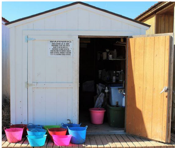
Color coded feed buckets prepared for horses requiring supplements

Our Horse Division Foreman, Zak Feeley, is in charge of daily horse care. Supplemental feed starts as grain and pellets, and is soaked in water to form a mush. Zak has a system to prepare and deliver the feed to individual horses during the day. All horses are weighed weekly to monitor their weight and feed is adjusted accordingly. Some of the horses require daily pain medication for arthritis, lameness, injuries, etc. Zak carves out horse cookies where he places the medications for these horses. They love him! Zak also treats wounds and ailments that horses experience. In addition to being an experienced horseman, Zak is a trained RN, and those skills are valuable in treating horses at Blue Rose Ranch. Zak routinely performs some procedures for us that usually require a veterinarian.