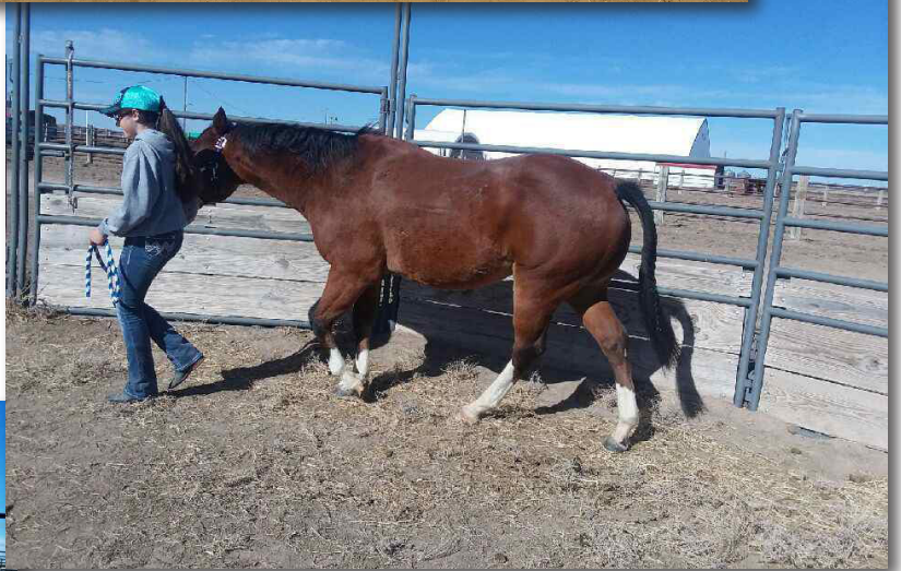
Jaycee's project measured heart beat at rest, after walking, and after trotting on varying ages of horses.